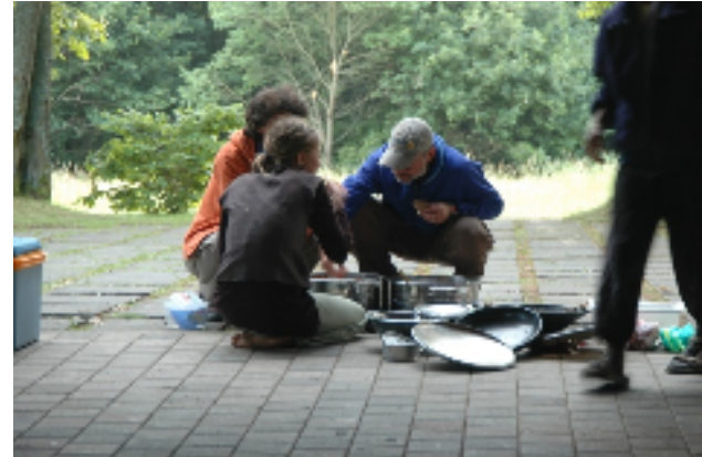
17 June Grenderich to **** (via Buchel) 34km