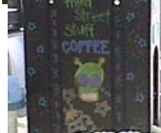
Coffee from Third Street Stuff kept participants sustained!