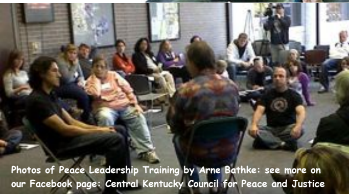
Photos of Peace Leadership Training: see more on our Facebook page: Central Kentucky Council for Peace and Justice

On Sat. Oct. 31, Paul conducted a one-day Peace Leadership Training session in Lexington attended by almost 60 people. In evaluations completed immediately after the session, 88% of participants who responded indicated they judged the training to "Highly" or primarily effective, and 82% said they were "Extremely" or highly likely to attend a future CKCPJ event. Our next steps to use this momentum include follow up with those participants to continue ongoing and further peace leadership training and support. If you were not able to come to this initial training with Paul but would like to go through the material and workbook he left with us, please call 849.338.2418, contact us by e-mail at peaceandjusticeky@gmail.com , or fill out and mail in the form, below. We also have a limited number of signed copies of Paul's second book The End of War: How Waging Peace Can Save Humanity, Our Planet, and Our Future for sale. Let us know if you'd like to purchase one.