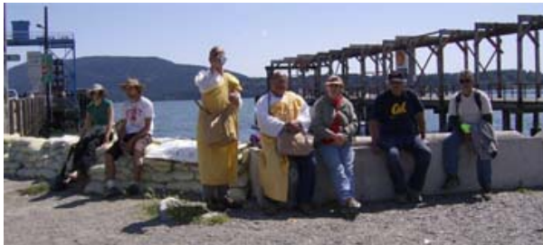
Waiting for the ferry to Lummi Island

Today we walk to the Lummi Indian Reservation. We actually made it to the overnight by noon and had lunch. While we were eating we were joined by a few locals who sang us some songs and a local reporter who joined us for lunch and then did some interviews with individual walkers. We still had a few more miles to walk and then we are going to take a short tour of Lummi Island (of course by foot). As we waited for the ferry it gave us a chance to