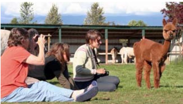
Some of the walkers get a closer look