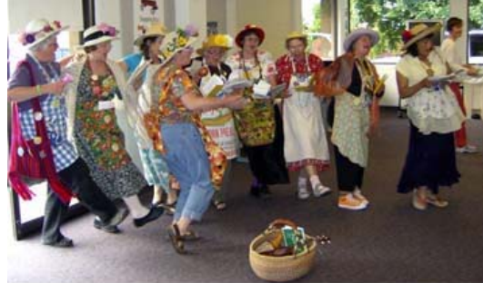
Dinner music provided by the Raging granuies

We were also entertained with some great songs accompanied by the gazoo, cybels and a ukulele. If you have never had the pleasure of a visit with the raging grannies I would recomed it. Check out their web site: http://www.raginggrannies.com