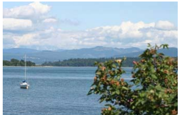
View from Lummi Island

with the Native community was when they wanted them to stop selling shell fish along the road I looked over to the road and sure enough not a vender to be found. As I was looking I could imagine how nice it would have been to see local venders selling fresh Oysters, Crab and Salmon and thought how sad it was that there was not more cooperation and understanding. We walked the mile across the Island and then we all headed to the local shop for a coffee. Then back across the ferry to load into the vehicles and headed back to the church.