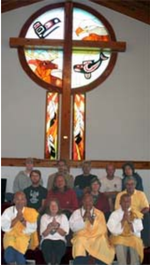
Group at Swinomish